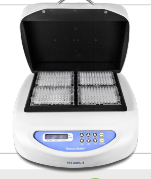
Plate Thermo-Shakers are designed for shaking and thermostating 4 standard 96-well microplates. A multisystem principle, used in design of the Thermo–Shaker, allows operating it as 3 independent devices: Incubator - Microplate-Shaker - Thermo-Shaker.